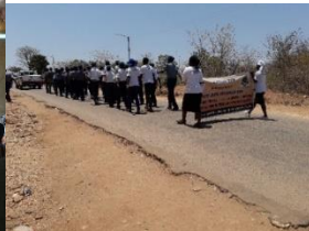
ZRP service Re launch