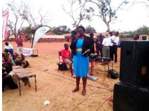
Gala for people living with disabilities Panenyaya