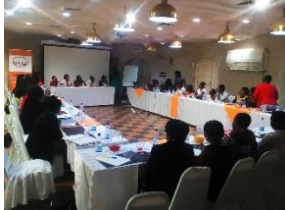
ZRP service Re launch