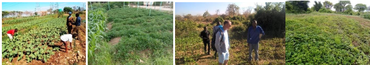
sweet potato Charara garden