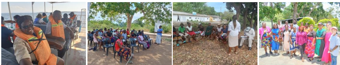
Business women& cancer Survivors

The organisation partnered other key stakeholders like DDC, Ministry of Women’s Affairs, ZRP, Women’s Coalition of Zimbabwe, AWET and Kasambabezi Community Radio to address gender disparities in resource allocation and identify key areas where men can support women in. Men owns mines and controls activities in the mining area therefore the DDC lobbied for a women in mining cooperative, all committees to be gender balance and equitable distribution of resources. During the year TWO had an opportunity to be visited by the African Finance Development Bank as they seek to know more about the Grievance Redress Mechanism Committee functions under Kariba Dam Rehabilitation Project of the Zambezi River Authority which is chaired by the Tony Waite Organisation Executive Director. See photo below of participants and stakeholder middle with min of women affairs left, DDC and Tony Waite director extreme right is the ADFB STAFF, ZRA & Tony Waite Org Director