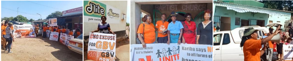
Nyamhunga People’s market

The organisation also attended the PROFISHBLUE meeting held Zambia looking at coordination and standardization of policies between Zimbabwe and Zambia. Dialogues with Persons with Disabilities