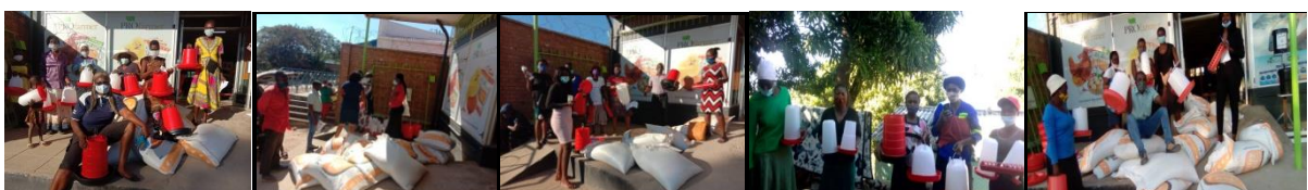
Group members receiving chicks.