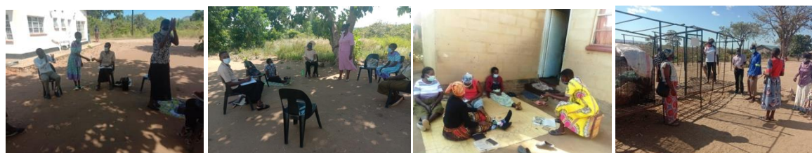
chicken pen supported by TWO