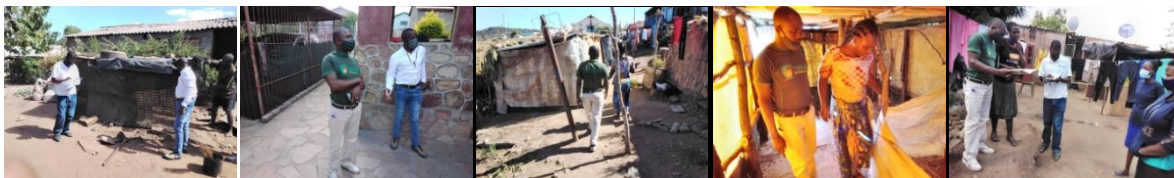
Arrival and registration

event as well as 1 board member. Among the stakeholders who attended the ceremony were Municipality of Kariba, Kariba AIDS Project, Ministry of Women's Affairs Small Medium and Enterprises Development, Pastors Fraternity, president office, women's coalition of Zimbabwe World Vision, and Labour. However, due to technicalities beyond control the handover of the feeds and chickens failed to take place and stakeholders left while beneficiaries remained polishing up their applications. Therefore, the beneficiaries received their feeds, drinkers, feeders and chickens on 16 June and 23 June respectively. A big handover could not be rearranged due to Covid 19 lockdown restrictions. ZWMB paid a total of ZWL 809 156.25 for 1175 chicks. The amount also covered for chemicals, drinkers and feeders. The pictures below are the handover ceremony with stakeholders in attendance before Covid 19 lockdown. Pictures below shows project assessment by ZWMB Credit Officers and TWO Programmes Officer.