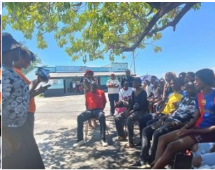
Mahombekombe Netball tournament