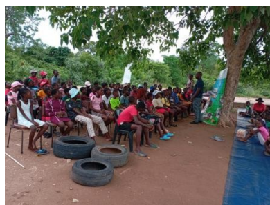
VFU officer facilitating