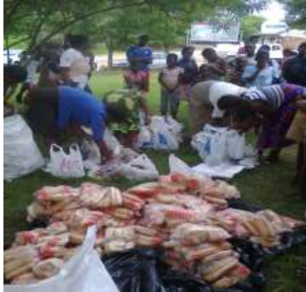
Bread roll distribution