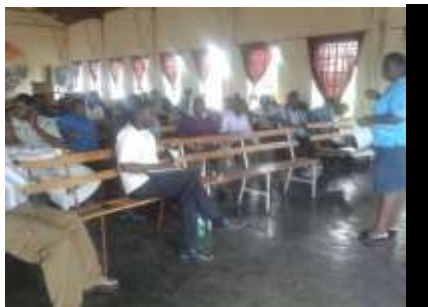
t-shirt distribution to work behavior change facilitators