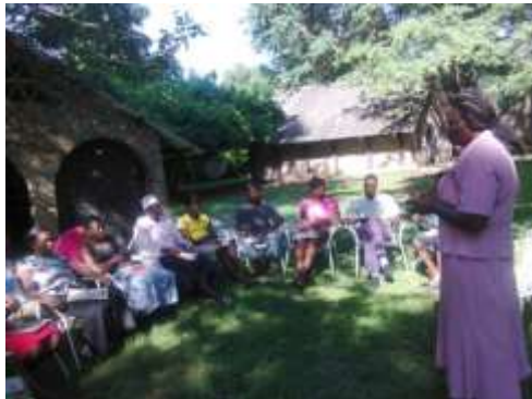
GSAL Training 2