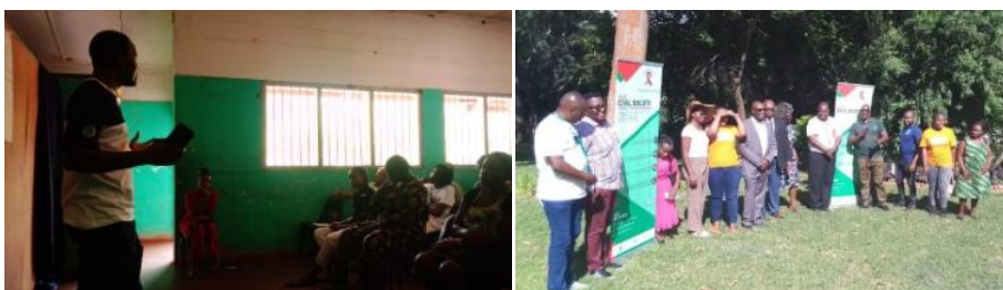
ZAN Mash West chapter meeting