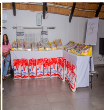
Hampers from Nyamurera Trust