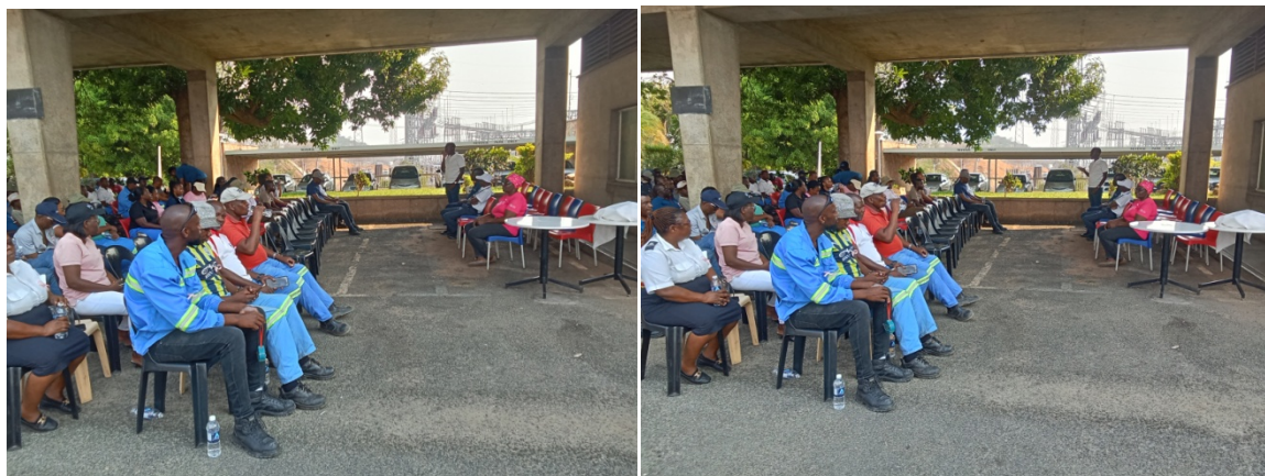
Table1: clients seen for Adherence Support

Zpc workplace cancer awareness 128 (100m 28f)